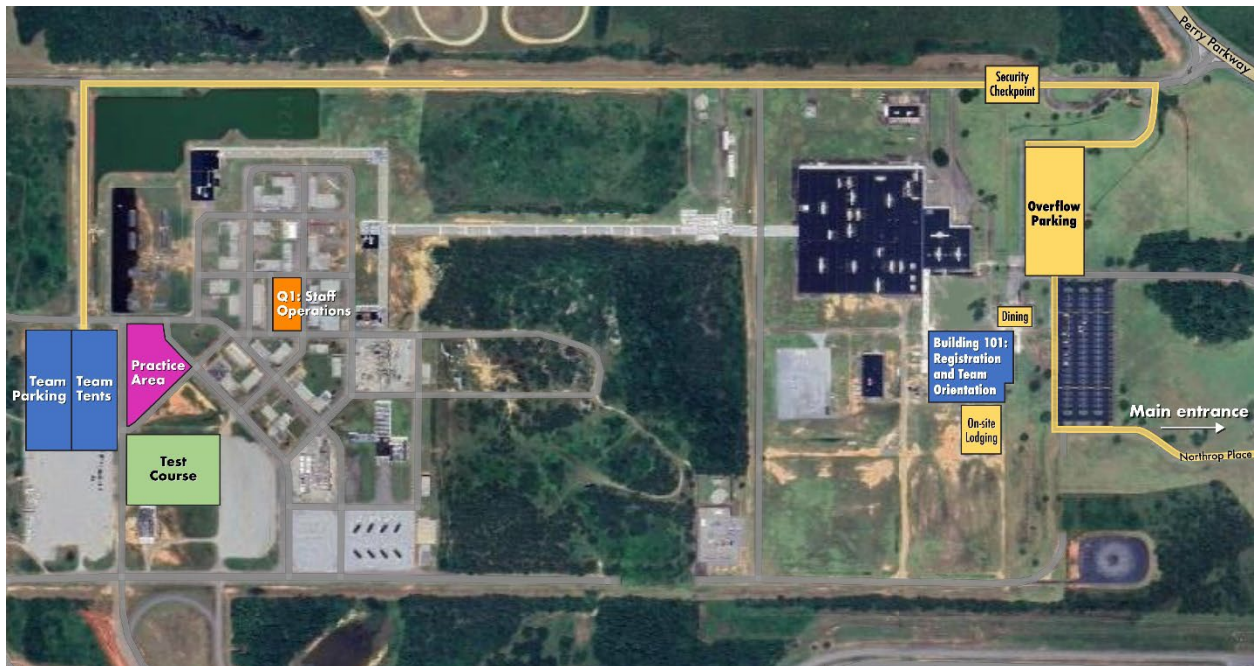
Figure 1: Guardian Centers Site Map