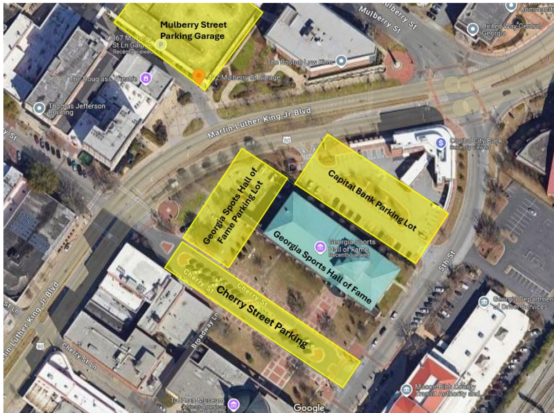
Figure 3: Georgia Sports Hall of Fame Parking Map