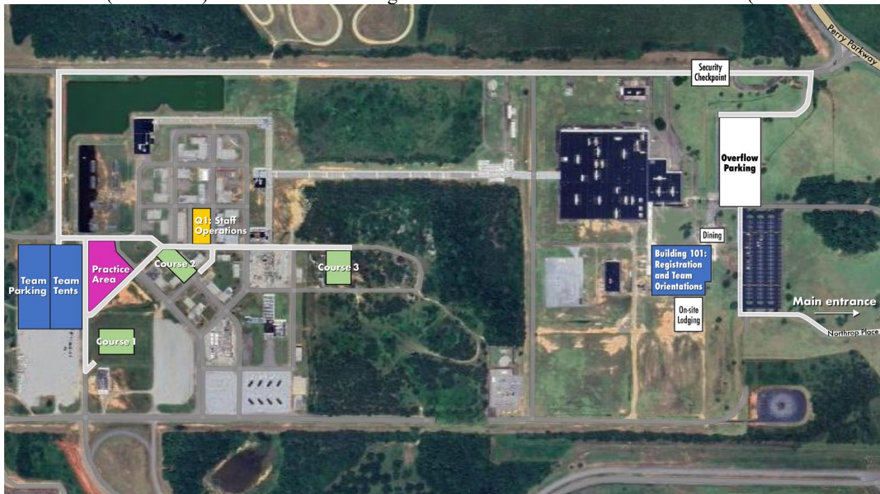
Figure 1). Teams will be responsible for providing transportation of their systems between their Team Tent and the Courses as needed. Per the Competition Rules , all system elements together must pack down to be carried by a single vehicle (car, sports utility vehicle, pickup truck), with individual components being easily portable by a single person.

Team Tents (work areas) will be within walking distance of the Courses and Practice Area (see